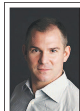
FRANK BRUNI Comment

As Florida Gov. Rick Scott spoke publicly of his heartache Sunday, I saw