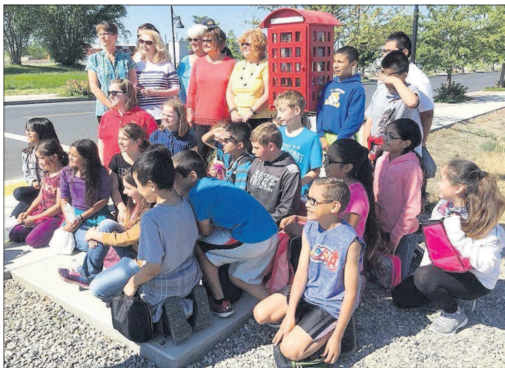
Members of Altrusa International of Hermiston, women from an Irrigon and Boardman community women's group and students from the elementary schools in Irrigon participated in a dedication of the Little Red Library May 25 near the Irrigon Post Office.