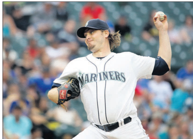
Seattle Mariners starting pitcher Wade Miley throws against the Cleveland Indians in the third inning of a baseball game, Tuesday June 7, 2016, in Seattle.

Cruz staked the Mariners to a 2-0 lead in the first inning, following