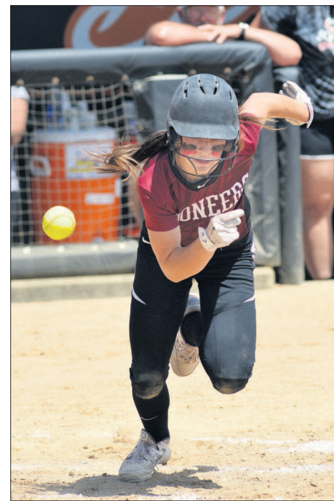
McLoughlin loses to Banks 5-2 in the state 4A state championship softball game Saturday in Corvallis.

It was her second straight year the Pioneers and Braves met in the championship and the third time in the last four years. Banks beat Mac-Hi 1-0 in 2013 for the second of its back-to-back titles, and the Pioneers won their second-straight title 4-0 over the Braves last season.