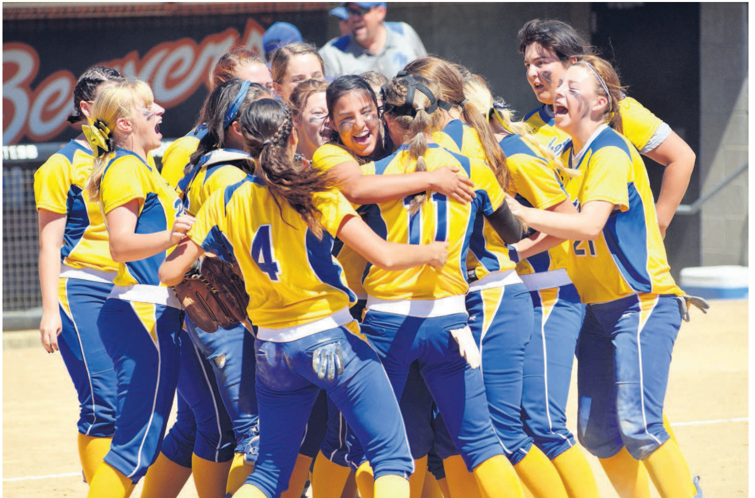
The Pilot Rock Rockets celebrate after winning the state 2A/1A championship softball game 9-2 over Union on Friday in Corvallis.