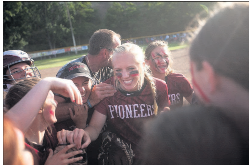
The Mac-Hi softball team celebrates beating Gladstone 3-2 in the OSAA 4A state semifinal softball game on Tuesday in Milton-Freewater.