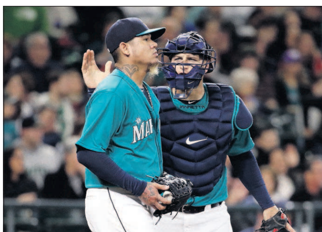
Seattle Mariners catcher Chris Iannetta, right, gives a pat to starting pitcher Felix Hernandez on Friday.