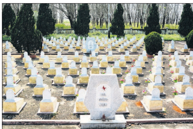
A cemetery honoring Vietnamese soldiers, mostly unidentified, at Gio Linh. The government is using DNA testing to identify the soldiers who died while at war with the United States.