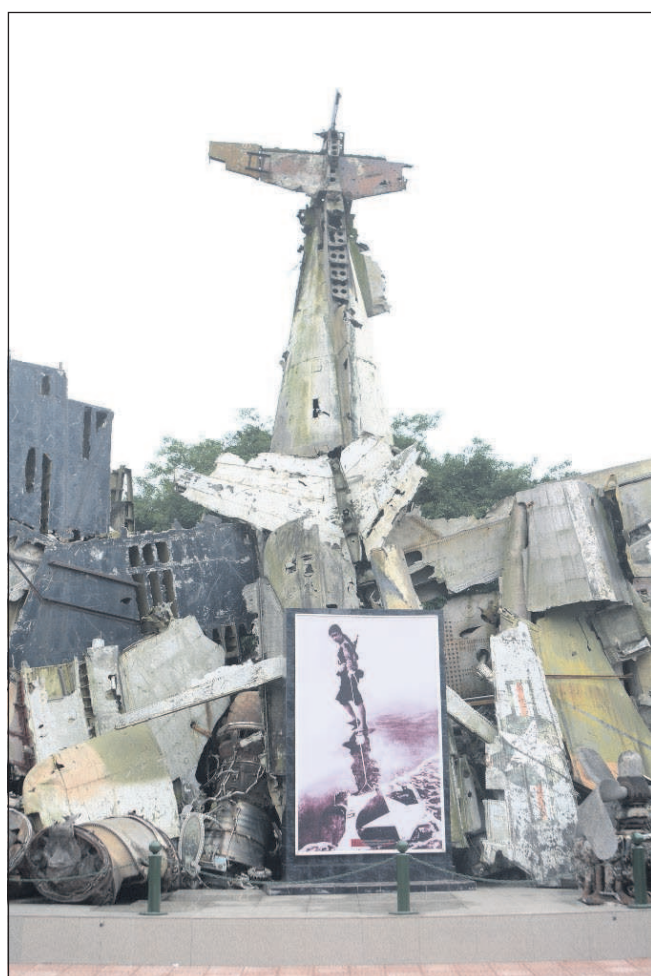
Pieces of American aircraft shot down in North Vietnam make a dramatic display at the War Memorial in Hanoi.

More photos and video online at www.eastoregonian.com