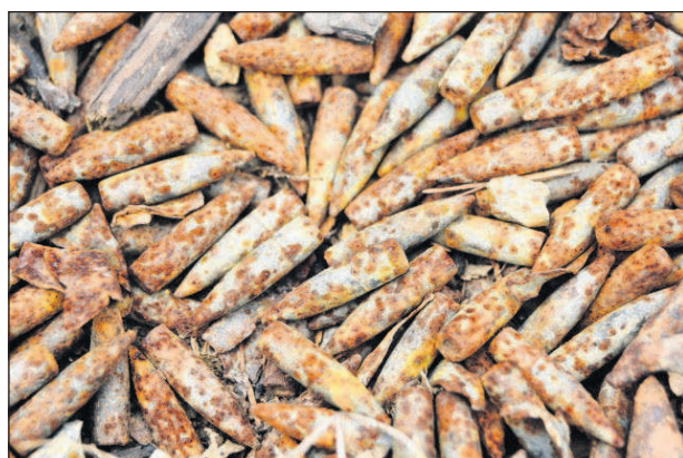
The remains of an ammunition cache near The Rockpile used by the North Vietnamese and the Viet Cong. Villagers near the site scavenged the brass but left the lead rounds.