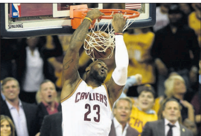
Cleveland Cavaliers forward LeBron James dunks against the Toronto Raptors during the first half of Game 2 of the Eastern Conference Final in Cleveland.

their second straight NBA Finals and trying to end Cleveland’s 52-year sports championship drought. Kyrie Irving scored 26 and Kevin Love 19 for Cleveland. The Raptors managed to hang around longer than in Game 1, when they were blown out by 31. But Toronto lacks the necessary firepower to stay with a Cleveland team playing its best basketball this season, one that James likened to a