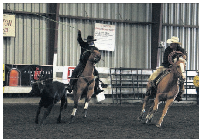
Riders show off the abilities of their horses during a preview for the working horse sale during the Pendleton Cattle Barons Weekend on Saturday.

Other events included the Western Select Invitational Horse and Working Dog sale, the Northwest Farm Credit Services Ranch Rodeo Championship, the D&B Supply Tradin' Post Trade Show, GRS Bit, Spur and Engraving Show and Sale, Pendleton Whisky Ranch Horse Championship and the Les Schwab North American Stock Saddle Bronc Championship.