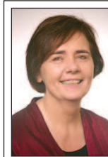
GAIL COLLINS Comment

Dumb is not going to get you a united convention. Let's just say too much of a good thing. But she does want free community college tuition. Did you know that? She announced it on the very first official stop of her campaign. Since then not, um, frequently.