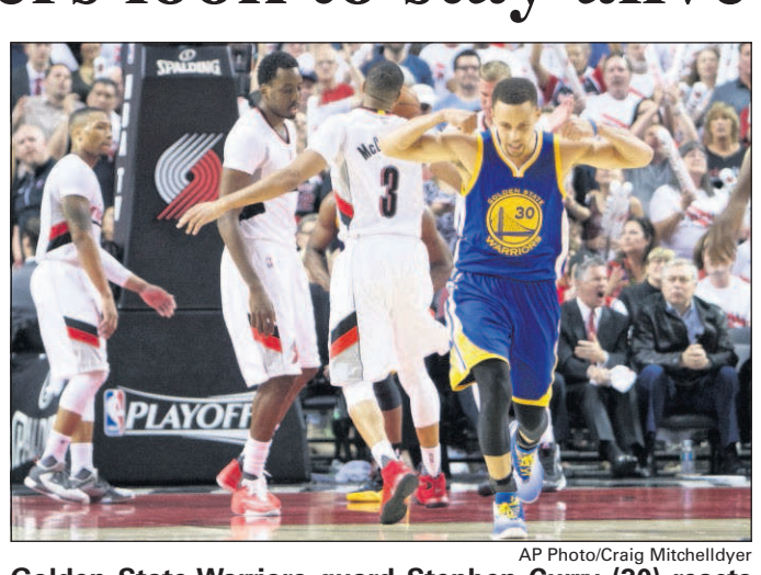
Golden State Warriors guard Stephen Curry (30) reacts after scoring a basket against the Portland Trail Blazers during Game 4 of Monday's second-round series in Port-

Curry and Golden State will host Portland in Game 5 of their second-round series on Wednesday night, the Warriors leading 3-1 and one win from another trip to the Western Conference finals. That game will be preceded by Wade and the Heat in Toronto, with their East matchup knotted at two games apiece after four extremely close — though not always aesthetically pleasing