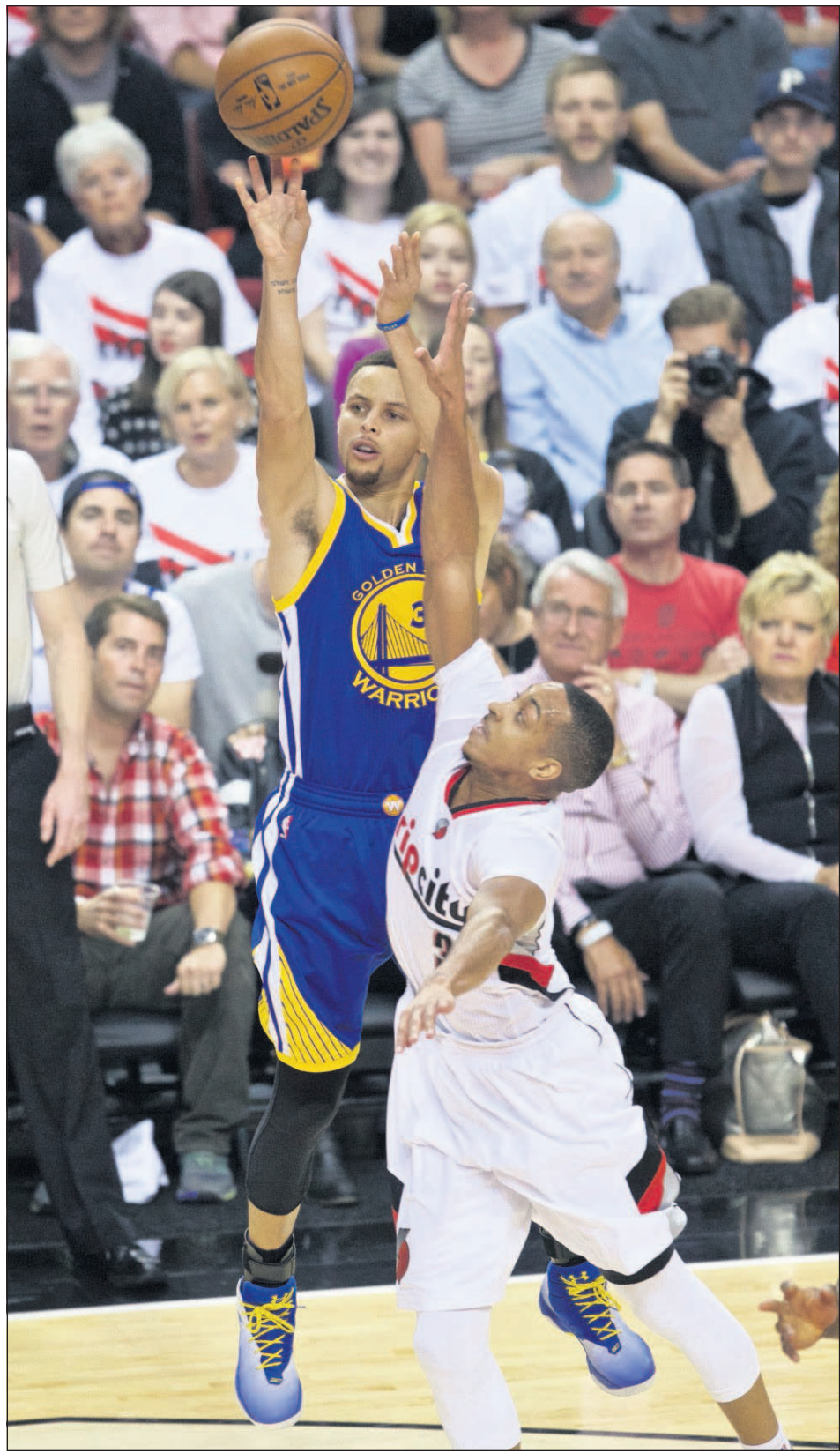
Golden State Warriors guard Stephen Curry, left, shoots over Portland Trail Blazers guard C.J. McCollum, right, during the second half of Game 4 of an NBA basketball second-round playoff series, Monday, May 9, 2016, in Portland.