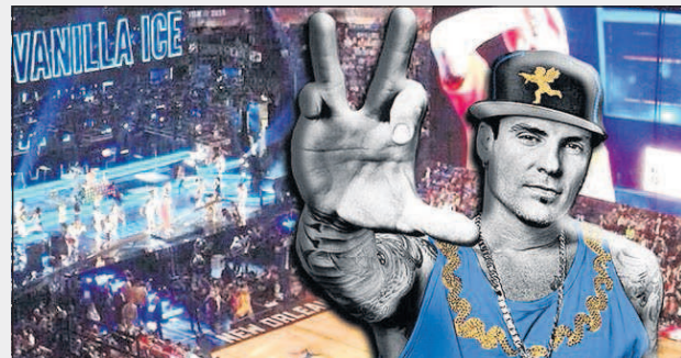
Vanilla Ice, along with Morris Day & The Time, will perform July 30 at Wildhorse Resort & Casino. Tickets go on sale Tuesday, May 10.