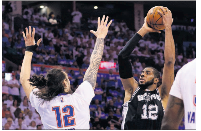
San Antonio Spurs forward LaMarcus Aldridge (12) shoots Oklahoma City Thunder center Steven Adams (12) defends during the second half of Game 3 of a second-round NBA basketball playoff series, Friday, May 6, 2016, in Oklahoma City. San Antonio won 100-96.