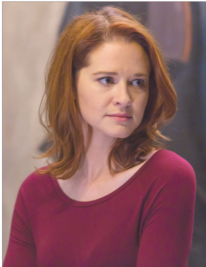
Sarah Drew stars in "Grey's Anatomy"