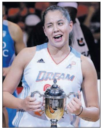
In this July 19, 2014 file photo, the East's Shoni Schimmel holds the MVP trophy after the WNBA All-Star basketball game in Phoenix.