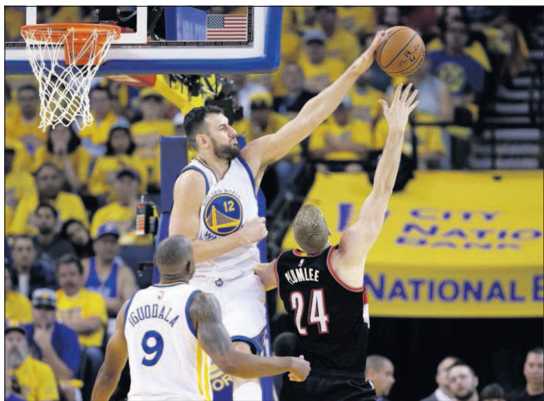
Golden State Warriors' Andrew Bogut (12) blocks a shot from Portland Trail Blazers' Mason Plumlee (24) during the second half in Game 1 of a second-round NBA basketball playoff series Sunday, May 1, 2016, in Oakland, Calif. Golden State won 118-106.

"It's very important we don't give up just layups early in the game," Bogut said. "We're trying to protect the paint and make sure they get nothing easy early."