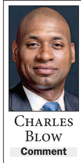
CHARLES BLOW Comment

to suggest that his guy, the ultimate branding machine, simply needs one more rebranding, that his problems pale in comparison to those of Clinton, his likely opponent.