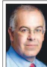
DAVID BROOKS Comment

source: the 19th-century poet and journalist José Martí. I was amazed how much Martí's name came up in conversation here and how little Fidel Castro's did. Martí is the national poet, the one who shifted the national imagination, who told Cubans who they were and what their story was. He inspired a common faith in a dignified future.