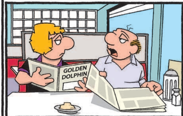
"I DON'T CARE WHAT'S TRENDING, I WANT A GRILLED CHEESE SANDWICH."