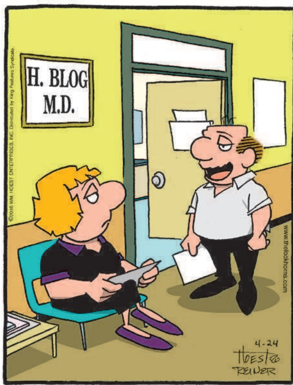
"THIS WAS A GOOD CHECK-UP... HE DIDN'T TELL ME TO STOP EATING ANYTHING."