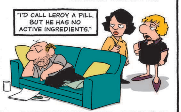
"I'D CALL LEROY A PILL, BUT HE HAS NO ACTIVE INGREDIENTS."