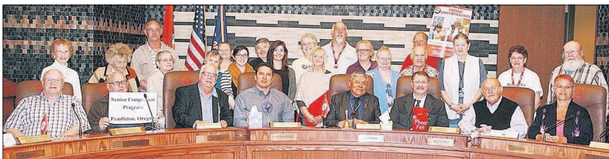
Representatives from the Confederated Tribes of the Umatilla Indian Reservation, Umatilla County and the city of Pendleton joined together April 12 to celebrate National Service Day.