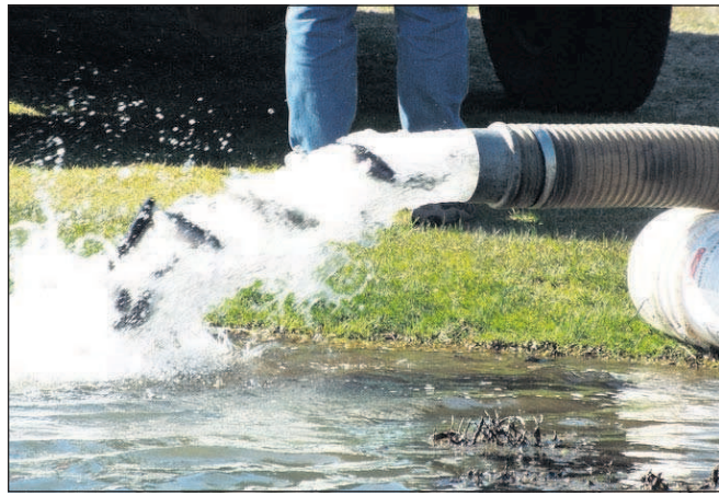
The McNary Channel Ponds near McNary Dam were recently seeded with approximately 2,000 fish.