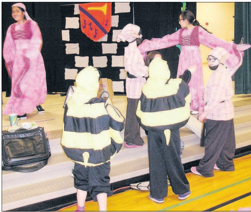
Three dozen Morrow County youths recently participated in a Missoula Children's Theatre production of 'Rumpelstiltskin.'