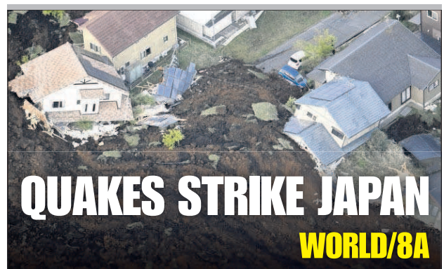
QUAKES STRIKE JAPAN WORLD/8A