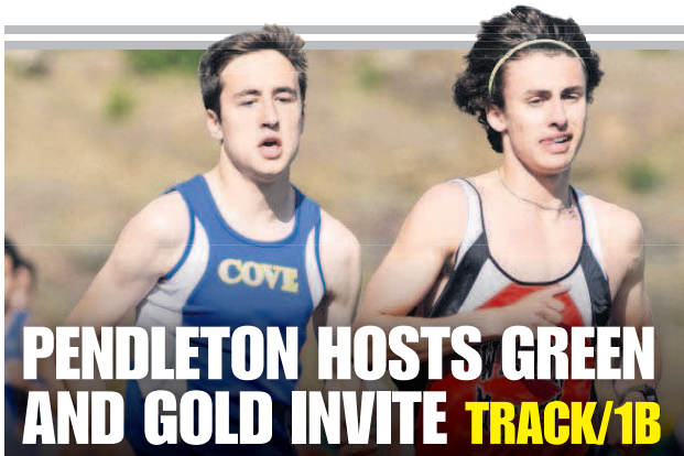
PENDLETON HOSTS GREEN AND GOLD INVITE TRACK/1B