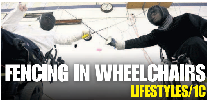
FENCING IN WHEELCHAIRS LIFESTYLES/1C