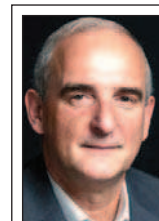
ROGER COHEN Comment

Berlin, well before Fukuyama, identified a potential weakness of liberalism. In "The Crooked Timber of Humanity," he wrote: "A liberal sermon which recommends machinery designed to prevent people from doing each other too much harm, giving each human group sufficient room to realize its own idiosyncratic, unique particular ends without too much interference with the ends of others, is not a passionate battle-cry to inspire men to sacrifice