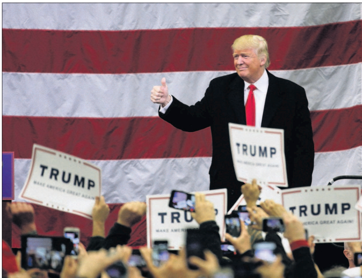
Republican presidential candidate Donald Trump arrives for a rally at Griffiss International Airport in Rome, N.Y., on Tuesday

Indiana's primary, for example, won't take place until next month.