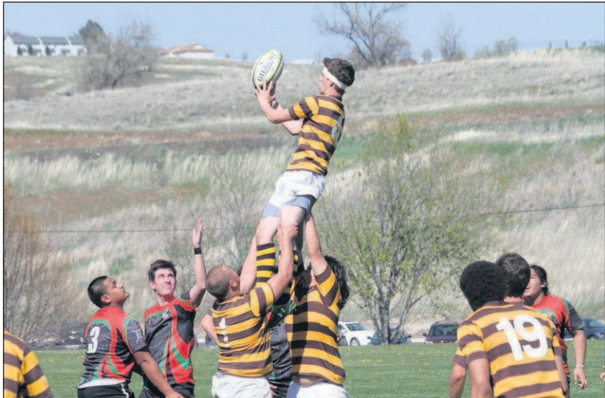
The East Oregon Sasquatch, striped jerseys, take on the Clark County Warriors in a rugby match on Saturday at Grecian Heights Park in Pendleton.

"I thought it was hard at first, but as we go on in practice and playing it's getting easier and more fun," she said. "I love it, I love the bonding with my teammates and love how we communicate out there."