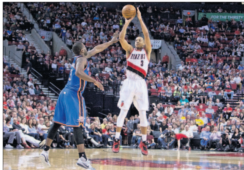
Portland Trail Blazers guard C.J. McCollum shoots over Oklahoma City Thunder guard Dion Waiters during the second half of an NBA basketball game in Portland, Ore., Wednesday, April 6, 2016. Portland won 120-115.