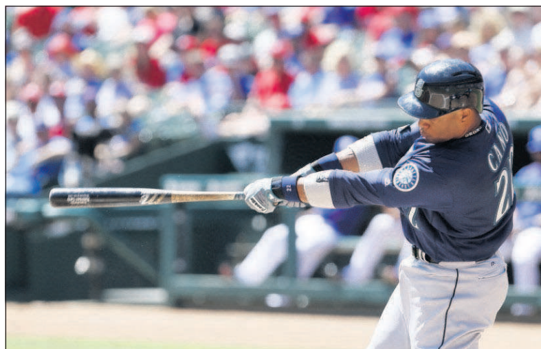
Seattle Mariners' Robinson Cano (22) makes contact for a two-run home run during the first inning of a baseball game against the Texas Rangers Wednesday, April 6, 2016, in Arlington, Texas.

ARLINGTON, Texas — Robinson Cano keeps going deep, and the Seattle Mariners are already starting to set a new tone in the AL West.