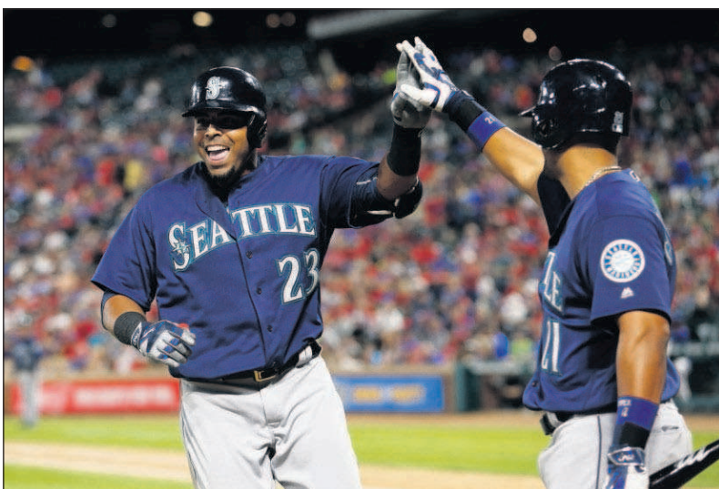
Seattle Mariners' Nelson Cruz is congratulated by Franklin Gutierrez, right, on his solo home run against the Texas Rangers in the fourth inning of Tuesday's game in Arlington, Texas.

second of two homers along with two doubles without getting an out in a six-run Seattle eighth.