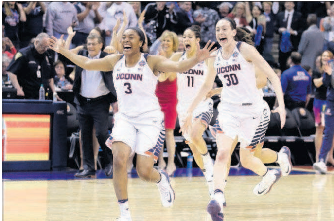
Connecticut's Morgan Tuck (3), Kia Nurse (11) and Breanna Stewart (30) celebrate after Connecticut's 82-51 victory over Syracuse in the championship game on Tuesday, April 5, 2016, in Indianapolis.