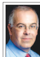
DAVID BROOKS Comment

Strong identities can come only when people are embedded in a rich social fabric.