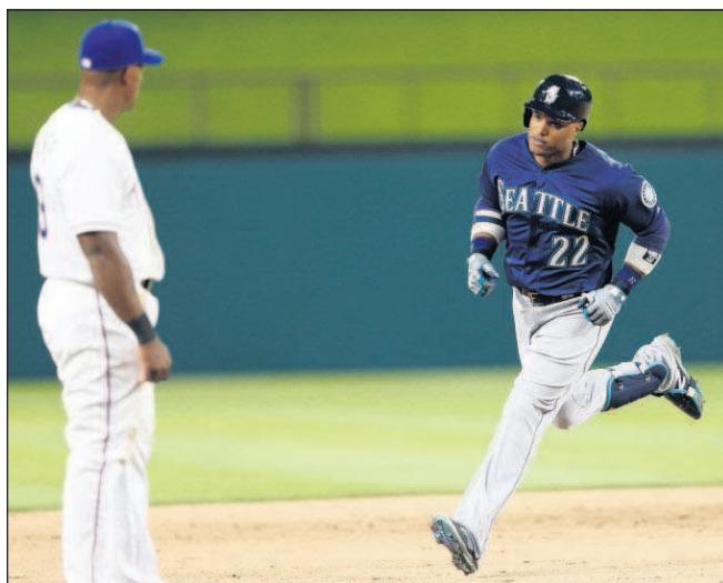
Seattle Mariners' Robinson Cano (22) circles the bases on his home run as Texas Rangers third baseman Adrian Beltre watches during the eighth inning of Tuesday's game in Arlington.

Rangers: RHP Colby Lewis opens his 11th big league season and ninth with Texas coming off career bests of 17 wins and 204 2/3 innings. The 36-year-old Lewis lost an eight-inning complete game at Seattle, 4-2, last August.