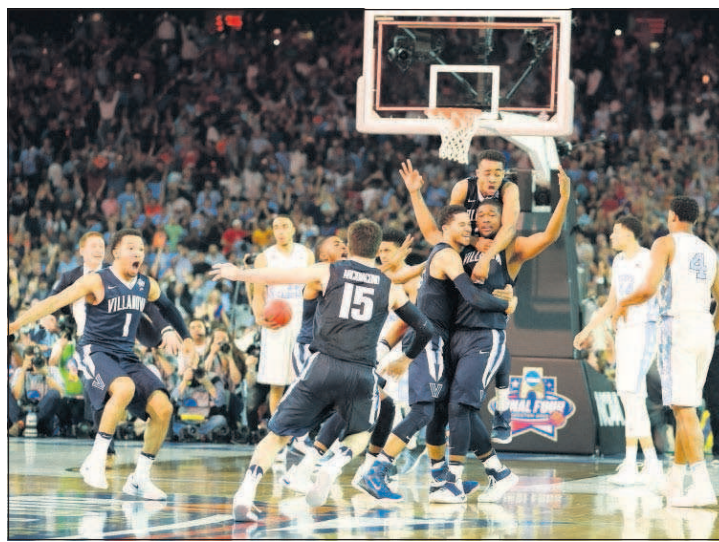
Villanova players celebrate after the NCAA Final Four tournament college basketball championship game against North Carolina, Monday, April 4, 2016, in Houston. Villanova won 77-74.