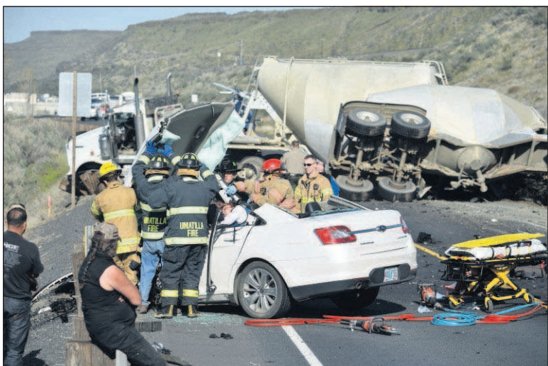
Firefighters from Hermiston and Umatilla remove the top of a car while extracting the driver of the vehicle involved in a collision with a cement truck on Highway 730 near milepost 197 on Wednesday east of Umatilla.