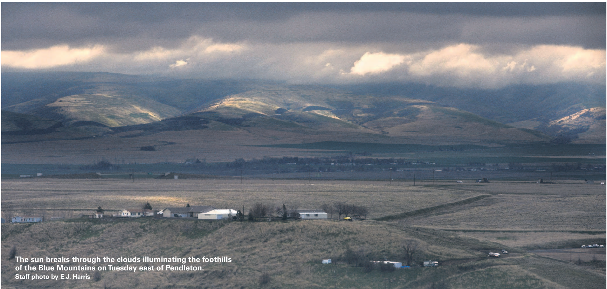
The sun breaks through the clouds illuminating the foothills of the Blue Mountains on Tuesday east of Pendleton.