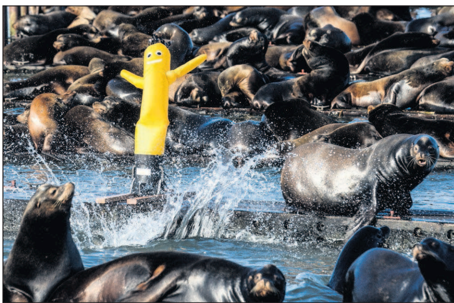
Sea lions and harbor seals dive off the docks of the East End Mooring Basin after crews from the Port of Astoria inflated air dancers.

"I think she's obviously had a steep learning curve," he said, "and I'm certainly not going to comment on her job performance."