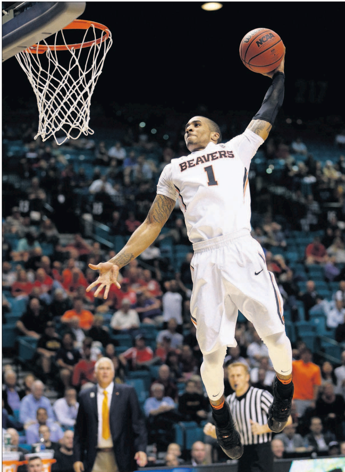
Oregon State guard Gary Payton II dunks against Arizona State during the second half of an NCAA college basketball game in the first round of the Pac-12 men's tournament Wednesday, March 9, 2016, in Las Vegas.