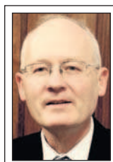
MARK REYNOLDS Comment

With so much at stake, we need a resilient and permanent solution. Congress must enact legislation that places an effective price on carbon, the