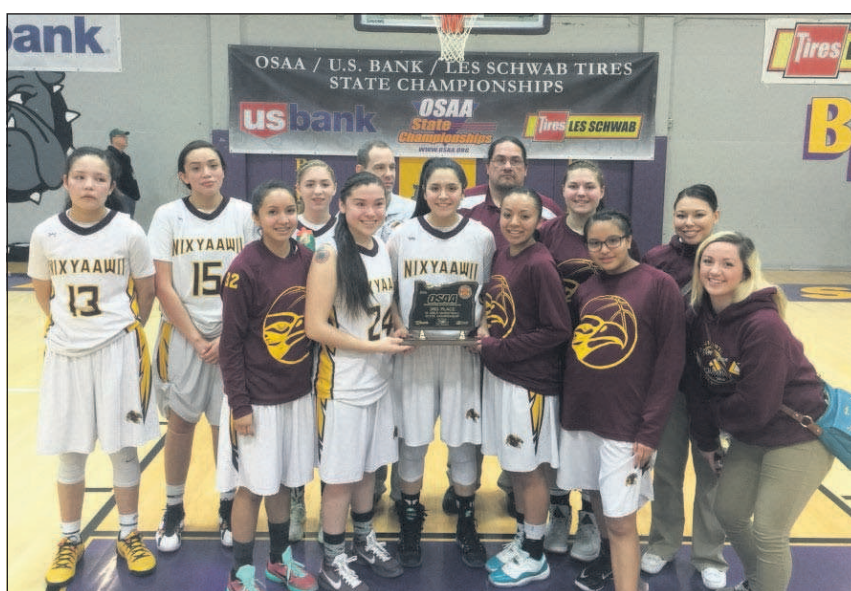
The Nixyaawii girls basketball team poses with its third-place trophy from the OSAA 1A state championships in Baker City on Saturday in Baker City.

Just like the Golden Eagles boys team did later in the afternoon, Nixyaawii never trailed in the game as they scored the first 12 points of the contest and held the Lions scoreless until the 3:13 mark of the first quarter. Their dominance continued in the second quarter as they breezed to a 32-20 lead as the