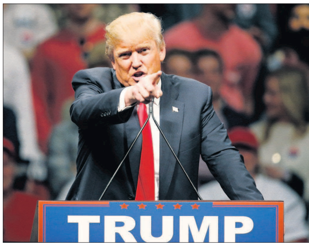
Republican presidential candidate Donald Trump gestures during a speech at a rally in Oklahoma City.

The fortune built by Trump's father, estimated at several hundred million dollars, came from low- and middle-income housing in Brooklyn and Queens. Trump wanted more. So he bet big on much richer Manhattan, a risk for the son of an outer-bor-