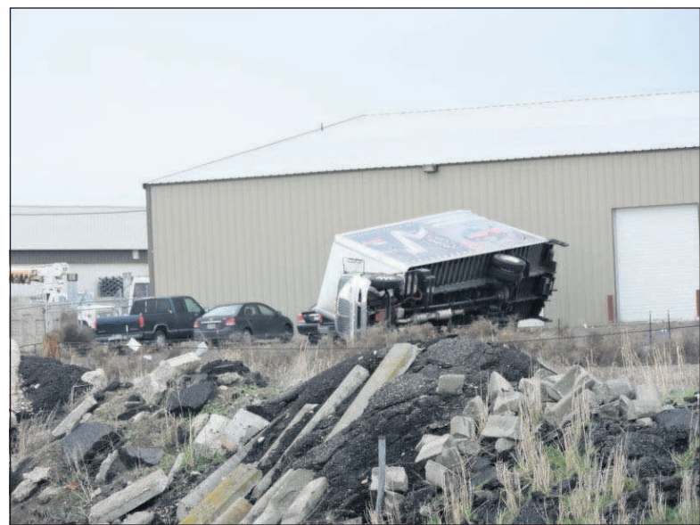
A "squall line" blew a parked semi-truck onto a pickup truck Friday afternoon at Shelco Electric in Hermiston.

At Hermiston Cinema on Theater Lane, a wind gust blew the building's HVAC system off the roof, dropping it on the gravel parking area on the north side of the building. Hermiston Fire & Emer-