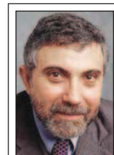
PAUL KRUGMAN Comment

But simply pointing to rising partisanship as the source of our crisis, while not exactly wrong, can be deeply misleading. First, decrying partisanship can make it seem as if we're just talking about bad manners, when we're really looking at huge differences on substance. Second, it's really important not to engage in false symmetry: Only one of our two major political parties has gone off the