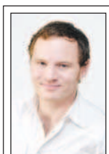
J.D. KINDLE Comment