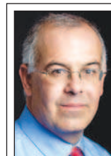
DAVID BROOKS Comment

Obama's basic approach is to promote his values as much as he can within the limits