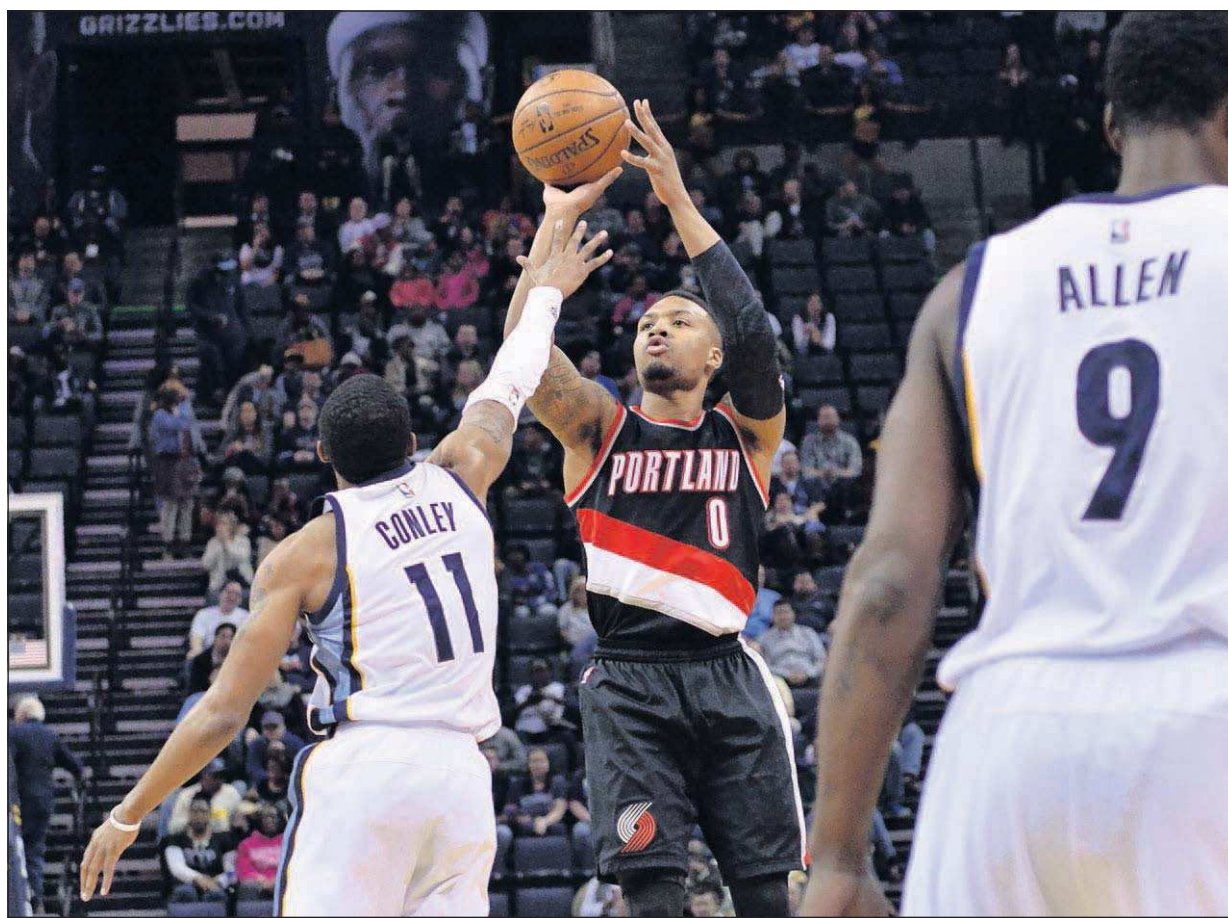
Portland Trail Blazers guard Damian Lillard (0) shoots against Memphis Grizzlies guard Mike Conley (11) in the first half of an NBA basketball game Monday, Feb. 8, 2016, in Memphis, Tenn.