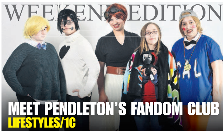
MEET PENDLETON'S FANDOM CLUB LIFESTYLES/1C