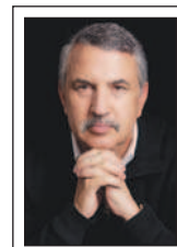
THOMAS FRIEDMAN Comment

Over the last few years we've been treated to a number of "Facebook revolutions," from the Arab Spring to Occupy Wall Street to the squares of Istanbul, Kiev and Hong Kong, all fueled by social media. But once the smoke cleared, most of these revolutions failed to build any sustainable new political order, in part because as so many voices got amplified, consensus-building became impossible.