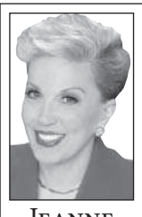
JEANNE PHILLIPS Advice

Dear Abby: My fiance is in the Marine Reserves. He has been in for five years, and his contract is due to end next year. After that, he will either resign or re-enlist.