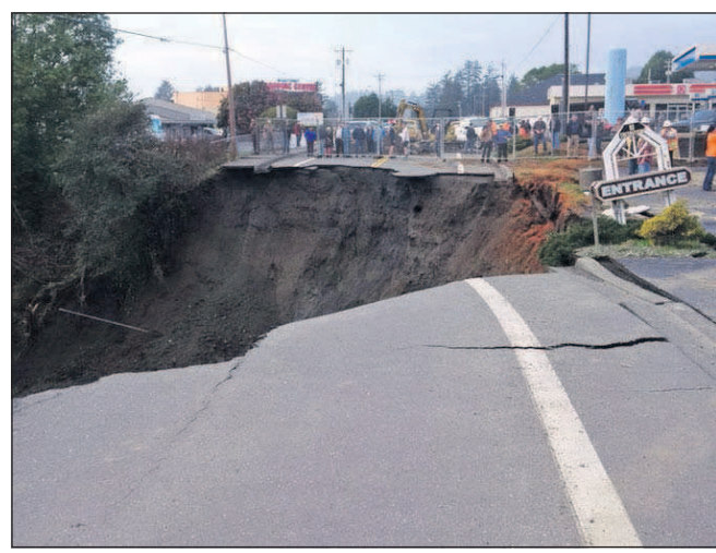
A massive sinkhole has opened on a road near Highway 101 in the Curry County town of Harbor. Signs have been placed along the highway directing traffic to a detour.

PORTLAND (AP) — Transportation officials say a massive sinkhole has opened near a highway along the coast of southern Oregon. The Oregon Department of Transportation says a sinkhole off Highway 101 has been plaguing the Curry County town of Harbor since heavy rains last month. A contractor was working on it Thursday when the erosion started to accelerate on a nearby road.