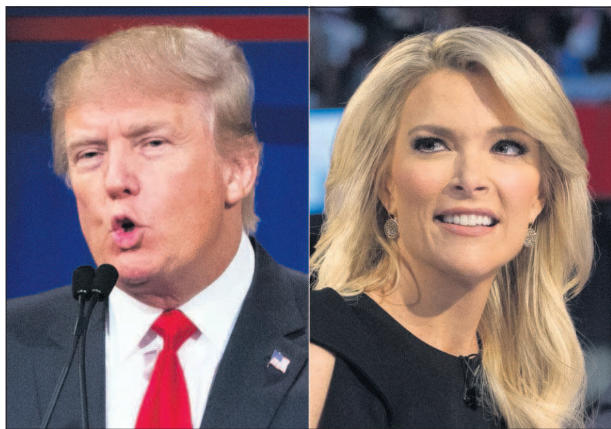
This file photo combination made from Aug. 6 photos shows Republican presidential candidate Donald Trump, left, and Fox News Channel host and moderator Megyn Kelly during the first Republican presidential debate at the Quicken Loans Arena, in Cleveland.

"My sense is those Iowa Republicans who weren't fans of Donald Trump before yesterday, this has only validated their opinion of him, and those Iowans who have been drawn to his passionate attack on the media and political elites in our country are even more emboldened