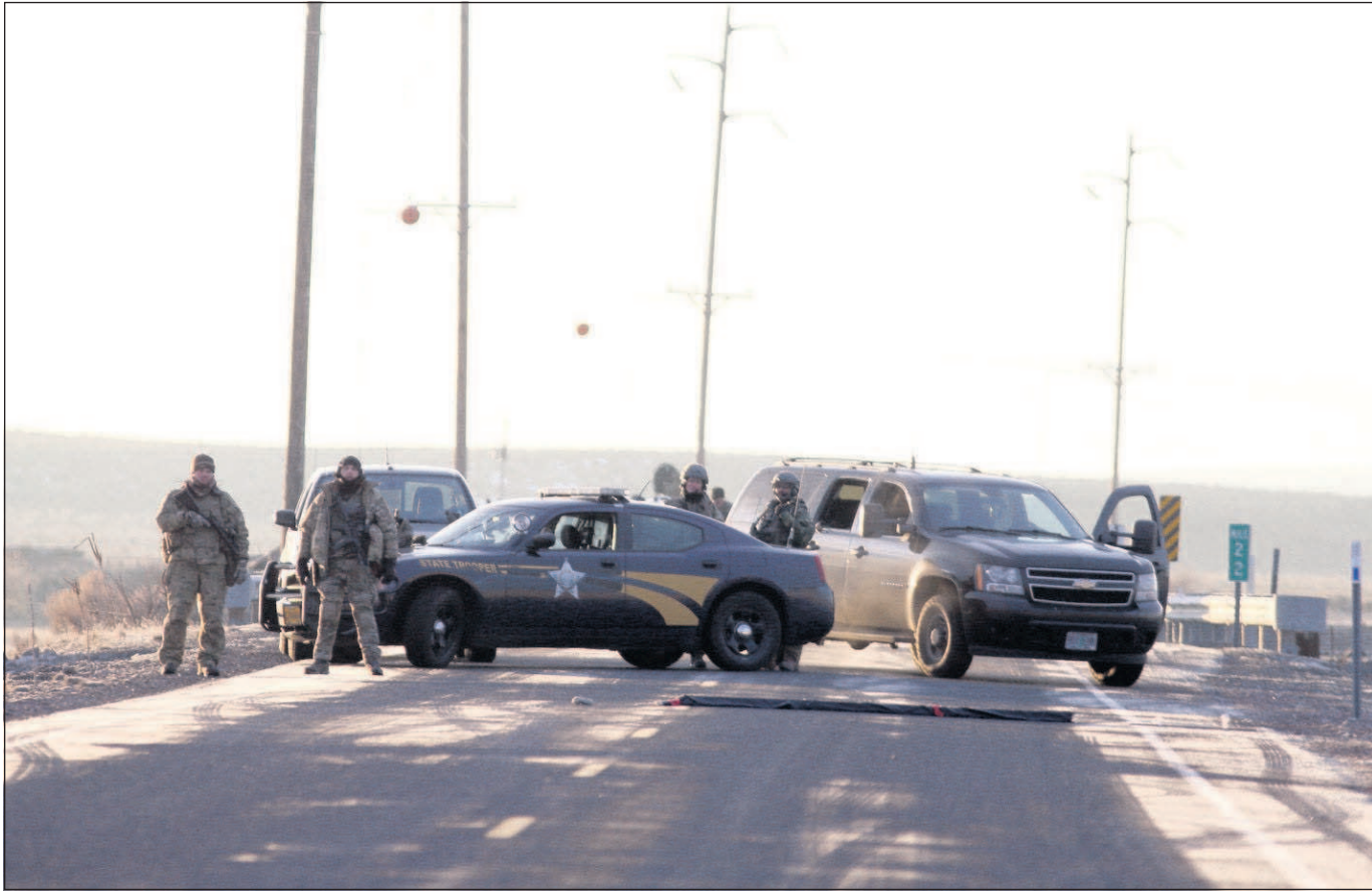
Police officers block the turnout to Sodhouse Lane, which is the main road leading to the Malheur National Wildlife Refuge headquarters, Wednesday near Burns. Authorities restricted access on Wednesday to the Oregon refuge that was occupied by an armed group after one of the occupiers was killed during a traffic stop and eight more, including the group's leader Ammon Bundy, were arrested.